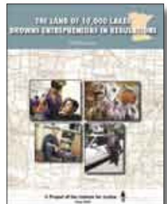
For a copy of this report visit www.ij.org/publications/city_study

“When my grandfather risked everything to start our company in 1956, he railed against the old-boy network that prevented him from get-