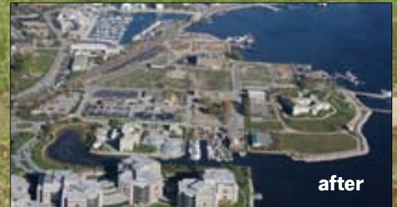
Land that once housed a neighborhood of homes in New London, Conn., now lies barren.