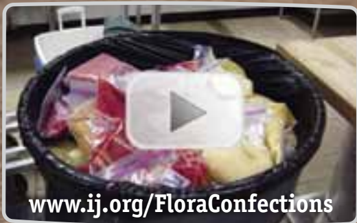
Chicago Tribune video of health inspectors destroying the property of IJ Clinic client Flora Lazar .