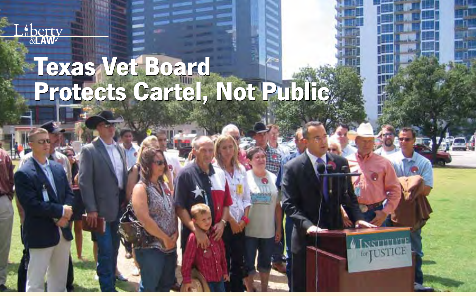
Horse owners and equine dental practitioners rallied in Austin to support economic liberty in the fight against the monopolistic system created by the Texas veterinary board.