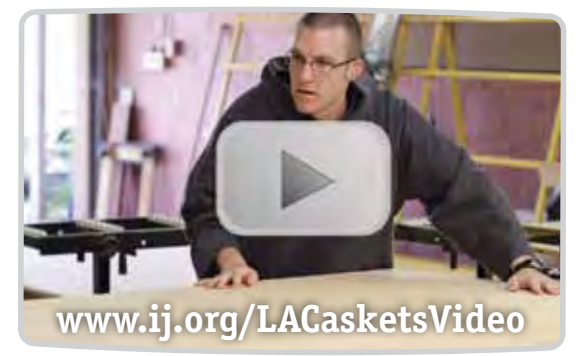
Watch the case video, "Free the Monks & Free Enterprise."