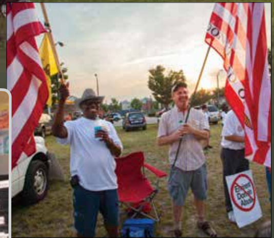
Activists meet to fight for free speech in Norfolk, Virginia.