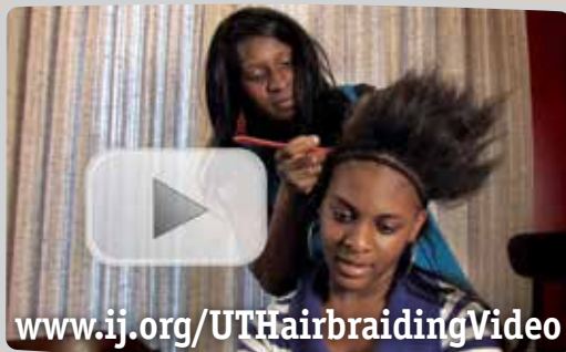
Watch IJ's video, “Untangling African Hairbraiders from Utah's Cosmetology Regime.”