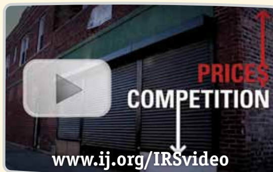
Watch the video, “IRS Protectionism: New licensing scheme challenged in major federal lawsuit.”

wide, Elmer offers an affordable, personal alternative to larger tax preparation companies.