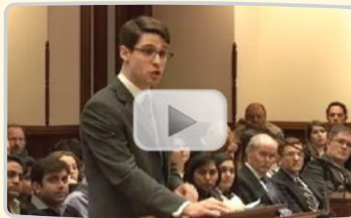
Watch the full argument in front of the Supreme Court of Texas at iam.ij.org/PatelVTexas .

Nevertheless, in 2009, the Department attempted a crackdown. It ordered eyebrow threaders to stop working, hit them with $2,000 in fines, and threatened to shut down their businesses. IJ swiftly sued on behalf of three Texas threaders and two salon owners.