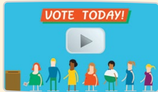
Watch IJ's new video "Gov't to Citizens: Want Free Speech? Take a number." at ij.org/mnspeechvid .

IJ's case may have been filed seven days after McCutcheon , but it took much longer than seven days to build. Last year, IJ's campaign-finance team saw