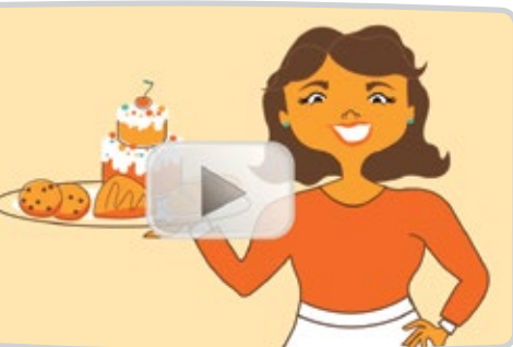
ch the video "Half-baked: Gov't Restricts Homemade kie Sales" at ij.org/MNCottageFoodsVideo .