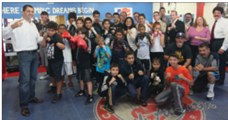
CYAC kids, parents, IJ attorneys and local counsel have reason to celebrate now that the Community Youth Athletic Center is no longer under the threat of eminent domain.

often themselves broken—physically, mentally and spiritually. All they want is to find a safe haven from neighborhoods that are infiltrated by gangs and, often, hopelessness. At the Community Youth Athletic Center, we take it upon ourselves to build these kids back up, showing them how strong, smart and successful they can be. Some of them have gone on not only to compete at the national championship level in boxing but also to do even bigger and better things with their lives.